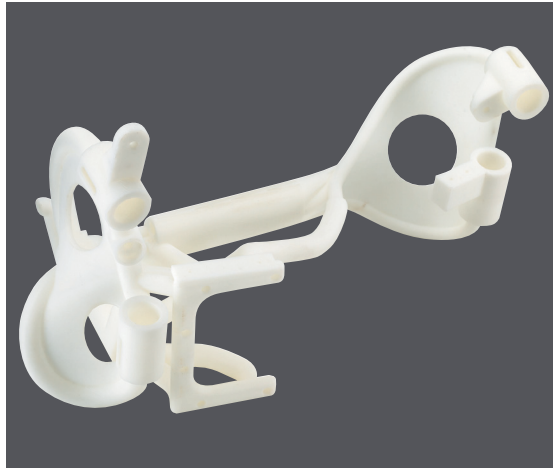
This ergonomic and lighter BMW hand tool reduced worker fatigue.

HOW TO REALIZE AN EXTREME REDUCTION IN TIME AND COST BY MAKING YOUR CUSTOM MANUFACTURING TOOLS VIA 3D PRINTING