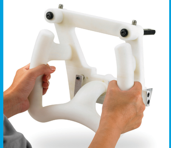
Using FDM, BMW prints jigs and fixtures that would not be possible with conventional machining and fabrication. 3D printing allows them to be easier to use and more functional.

Your current inventory of jigs and fixtures were designed with consideration for the capabilities and limitations of the fabrication methods used to create them. By adhering to design for manufacturability (DFM) rules, you made them practical, kept cost to a minimum, and made lead times reasonable. These rules don't apply to 3D printing. They have no bearing on time, cost, quality, performance or practicality. In some cases, adhering to old DFM rules may actually have the opposite effect. The additive nature of the process gives you unmatched freedom of design. What may have been impractical is now realistic and reasonable. Jigs and fixtures can have complex, feature-laden and freeform configurations without adding time and cost. In fact, added complexity may even reduce cost and time. For example, pockets, holes and channels reduce material consumption, build time and total process time.