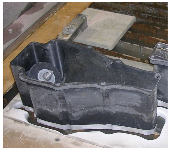
Top NASCAR team, Joe Gibbs Racing, uses FDM to make fixtures, some of which have been in service for more than two years and have cut lead time and expense by an average of 70 percent.